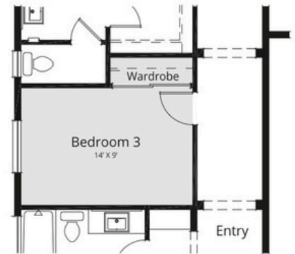
Bedroom 3 Option